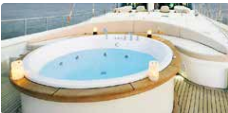
Jacuzzi on the deck of a luxury yacht.