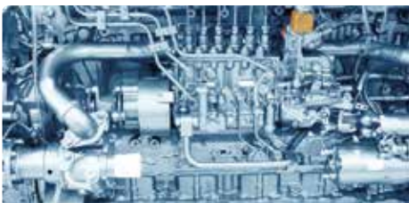
Kitchen appliances (top)