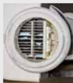
Swimming pool filter