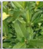
Plants and gardens