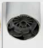
Nozzle of a faucet