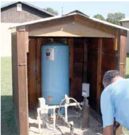
Home well water system