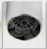
Nozzle of a faucet