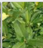
Plants and gardens