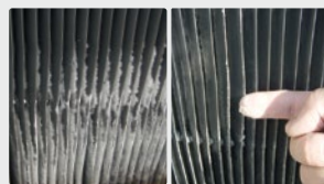
Cooling tower grids