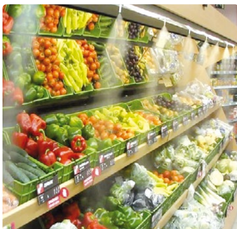
Misters in food section