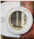
Swimming pool filter