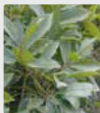
Plants and turf