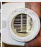
Swimming pool filter