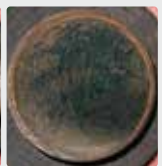
Biofilm in a piping system