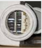
Swimming pool filter