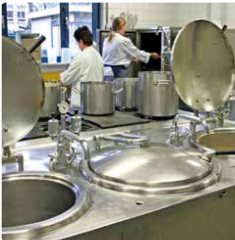
Professional kitchen on board of a military ship