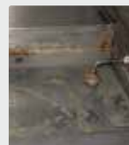
Grill plate in a kitchen