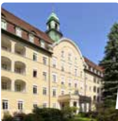
St. Joseph Hospital, Berlin