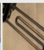
Heating element in a hot water tank