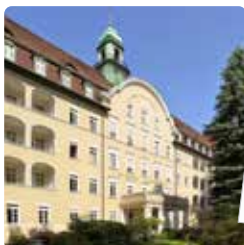
St. Joseph Hospital, Germany