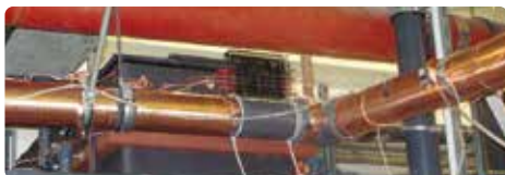
Vulcan S250 installed in the St. Joseph Hospital

" ... a couple of months ago we had the Vulcan S250 installed inside the hospital. We can identify considerable benefits of the unit installed. We can barely see any scale deposits on the shower heads for example any more. This saves manpower and costs of the replacement of sanitary equipment. We can honestly recommend the unit installed by Christiani Wassertechnik GmbH ... "