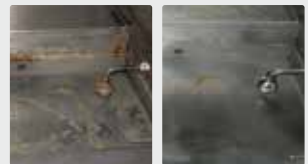
Grill plate in a restaurant