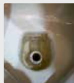
Sanitary toilet bowl