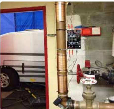
Vulcan S25 installed at Ice Land in New Jersey, USA.