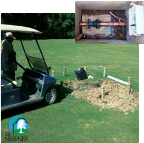
Vulcan installed underground at Las Misiones Golf Course