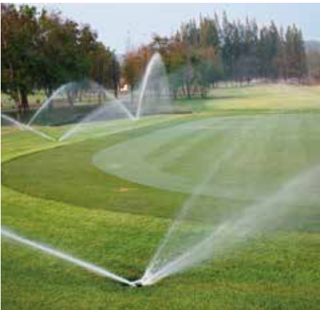
Sprinkler system in a golf course