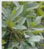
Plants and turf