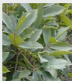
Plants and turf