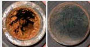
Biofilm in a piping system