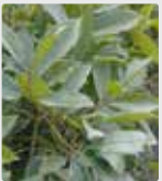
Plants and turf