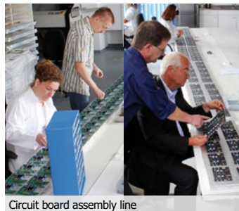
Circuit board assembly line