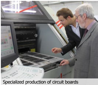
Specialized production of circuit boards