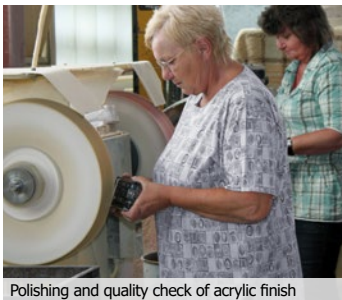
Polishing and quality check of acrylic finish