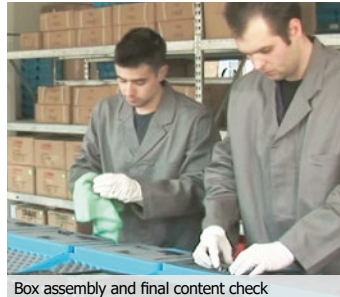
Box assembly and final content check