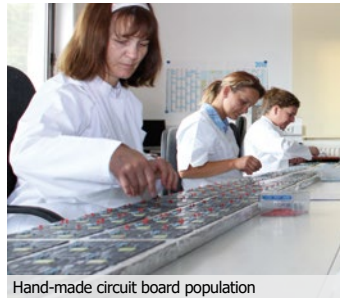
Hand-made circuit board population