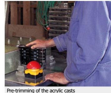
Pre-trimming of the acrylic casts