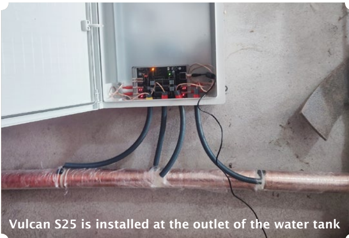
Vulcan S25 is installed at the outlet of the water tank

After additional 6 months (end of 2024) we will check and report the increase of milk yield. Also these parameters will be checked: milk yield, production quality, increase of production fat, which is offered in the nutrition of the animals and the decreasing of the mortality rates of the born calves.