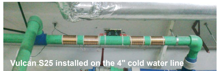
Vulcan S25 installed on the 4" cold water line

Yas Island is one of the world's most exciting travel destinations.