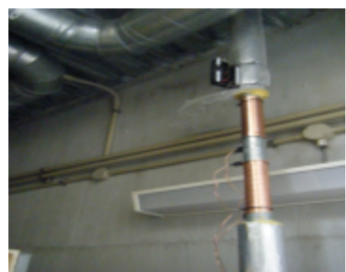
The Vulcan 5000 instration at outlet of the water tank.