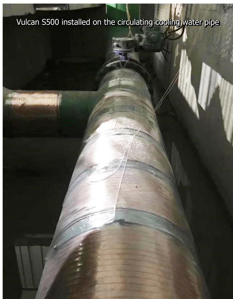
Vulcan S500 installed on the circulating cooling water pipe

Sinoway currently owns and operates two plants, one located in Shandong Province and the other plant is in Jiangsu Province.