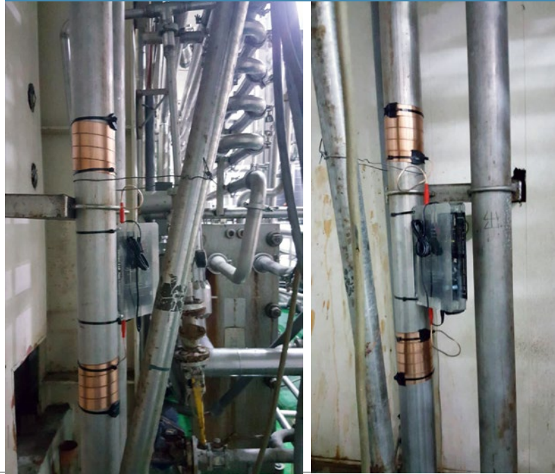
Vulcan S10 installed on the 3" circulating water pipe