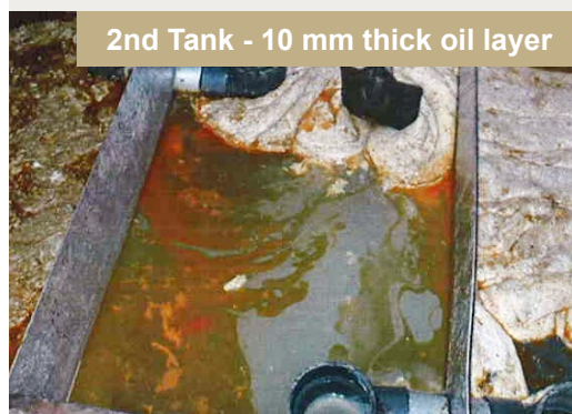
2nd Tank - 10 mm thick oil layer