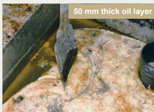
50 mm thick oil layer