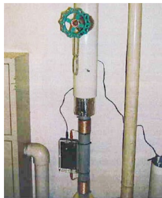
Vulcan 5000 was installed in the factory kitchen

As for the cleaning intervals, monthly cleaning may now not be required. The effect and cleaning intervals of Vulcan will require an annual observation, however, I believe the amount of cleaning will be reduced remarkably.