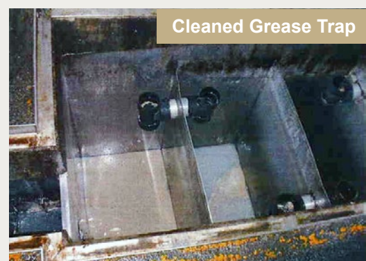
Cleaned Grease Trap