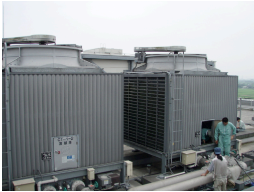
2.1 Cooling tower A 2.2 Cooling tower B