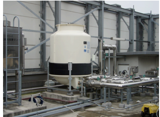
1 Cooling tower C