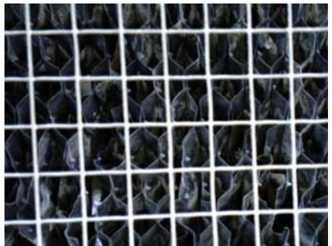
These photos were taken of CT-1 after about 6 weeks (August 20, 2013).