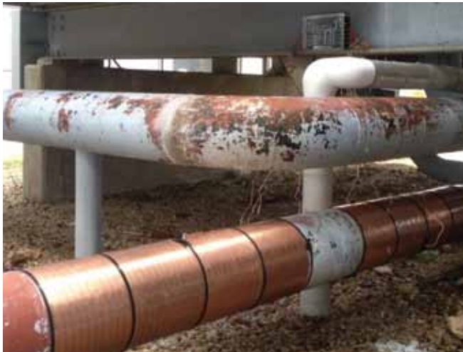
Vulcan S250 installed on a 10 inch diameter line that feeds twin cooling towers (CT-1 and CT-2)