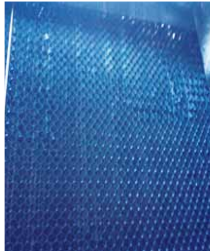
This photo was taken of the inside of CT-1 on August 9, 2013.

It illustrates clean flutes that are in constant contact with Vulcan-treated water and a few dry (untreated) areas that still have some remaining green biofilm.