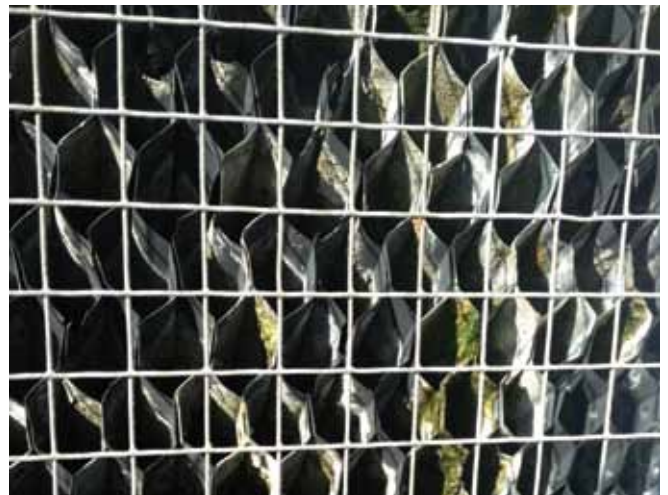
The photographs above were taken of CT-1 about 3 weeks after the Vulcan was installed (August 6, 2013).