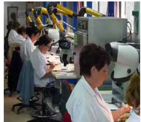
Avignon Ceramic production line