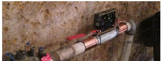
Vulcan S10 installed in the Alcoa Aliminum factory in France