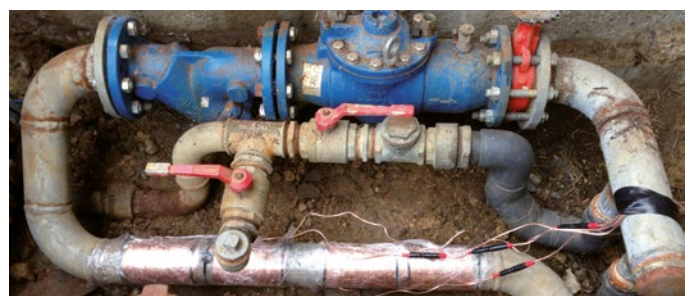
Vulcan S25 installed in the Alcoa Aliminum factory in France