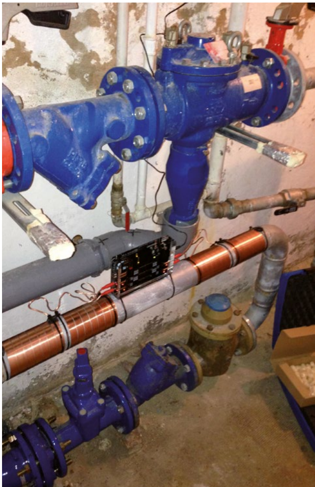
Vulcan S25 installed in the Alcoa Aliminum factory in France

Their facilities in France produce technologically advanced products that include aluminum sheets and plates, aluminum architectural products and systems, fasteners and fastener installation systems, structural castings, turbine engine components and aircraft frame components. Alcoa employs approximately 61.000 people in 30 countries worldwide.