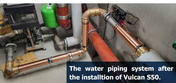
The water piping system after the installtion of Vulcan S50.