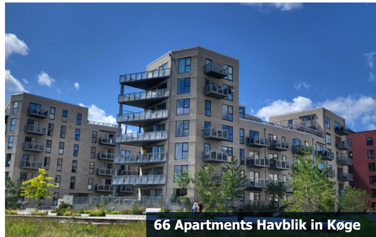
66 Apartments Havblik in Køge