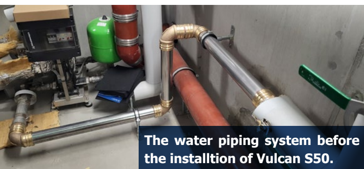
The water piping system before the installtion of Vulcan S50.