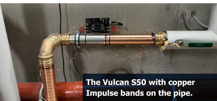
The Vulcan S50 with copper Impulse bands on the pipe.