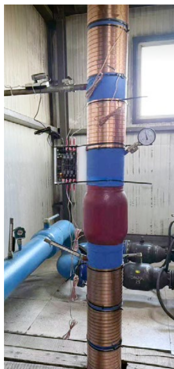
Vulcan S150 on the supply pipeline of the heating boiler